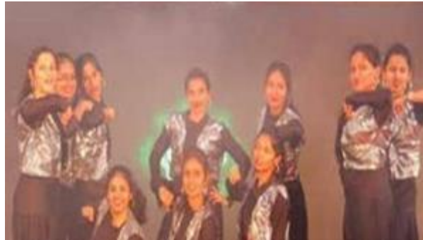
Group Dance Team – Milana 2K18

E-mail: engprincipal@theoxford.edu Web: www.theoxfordengg.org