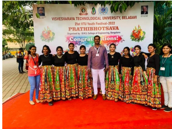
PRATHIBHOTSAVA - 2022