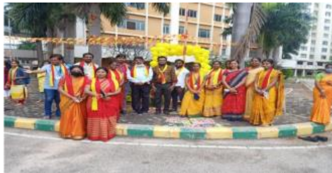
KANNADA RAJYOTSAVA CELEBRATION