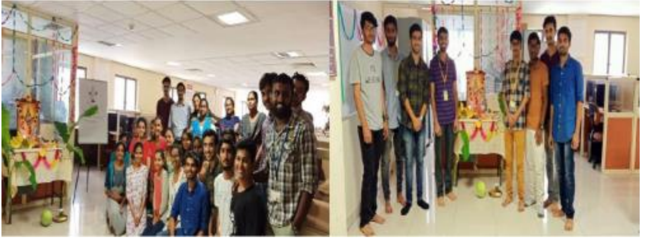
AYUDHA PUJA CELEBRATION

E-mail: engprincipal@theoxford.edu Web: www.theoxfordengg.org