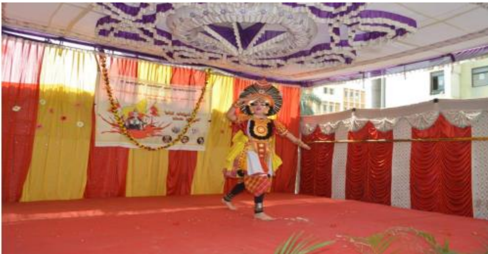
Karnataka Cultural dance – Yakshagana