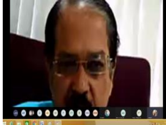
REPUBLIC DAY WELCOME DANCE REPUBLIC DAY ADDRESS BY DIRECTOR