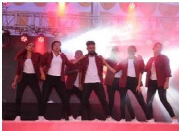
Group Dance team for the Milana-2k19